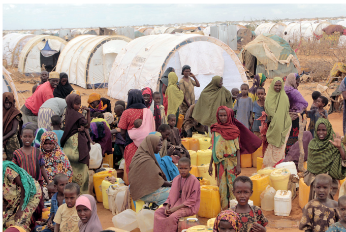
HAND WASHING WITH SOAP - KISENYI REFUGEE HOSTING AREA