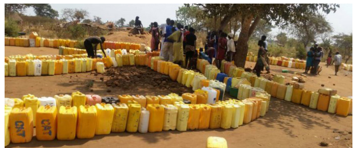
Some refugees access water through public tap stands.

The SPHERE 2 standards which were developed and adopted before the COVID-19 pandemic, stipulate a water service level of at least 20 liters per person per day (l/p/d) for refugees in all settlements in Uganda.