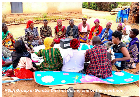
VSLA Group in Gomba District during one of the meetings