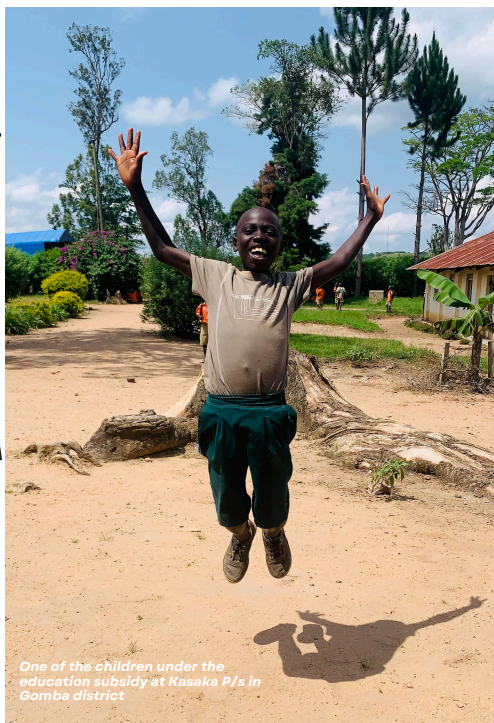
One of the children under the education subsidy at Kasaka P/s in Gomba district