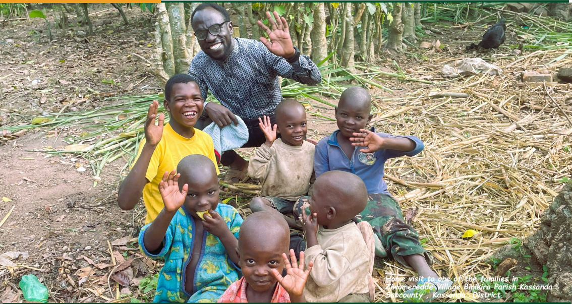
A one visit to one of the families in Lukwera subcounty, Kassanda District.