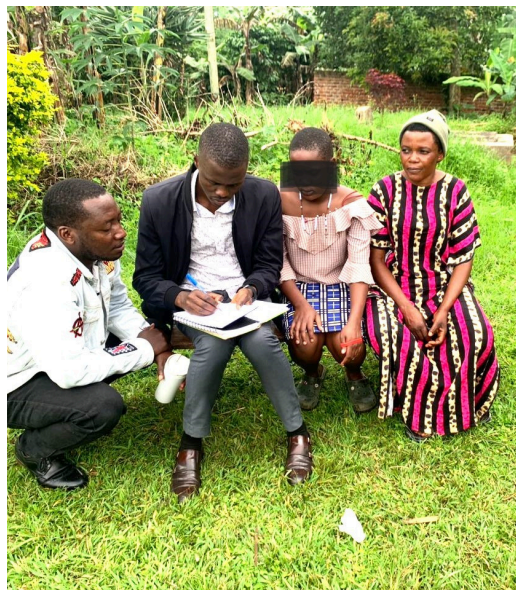
Care and Treatment Specialist second from left, social worker (left) and Parasocial worker (right) developing an adherence and care plan for an adolescent in Kyenjojo District

Taking critical interventions to scale and ensuring quality service delivery guided by Activity/Line ministry Standard Operating Procedures (SOPs)