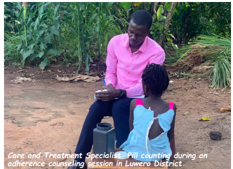
Care and Treatment Specialist Pill counting during an adherence counseling session in Luwero District.