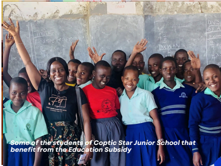
Some of the students of Coptic Star Junior School that benefit from the Education Subsidy